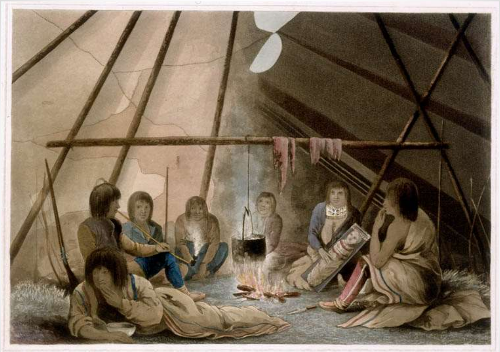
Robert Hood, Intérieur d'une tente crie, 25 mars 1820.