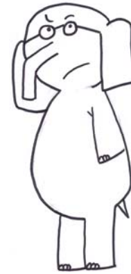
There is a frog on your head