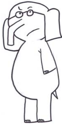
There are 3 bees on your head