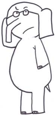
There is a frog on your head