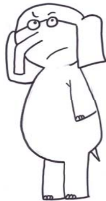
There are 2 frogs on your head