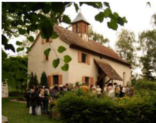
(right) The venue