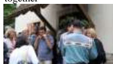
(below) Post concert get together