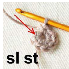
Pic. 9 Make 8 sc in magic ring, sl st in the 1 st sc of the rnd.

Rnd 2. Continue with yarn C1. Work this rnd in BL.