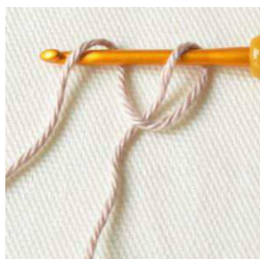
Pic. 7 Make a ring, yo through ring

Make a magic ring, ch1 and 8 sc in magic ring, finish with a sl st in the 1 st st after ch1; don't fasten off. (= 8 sts)