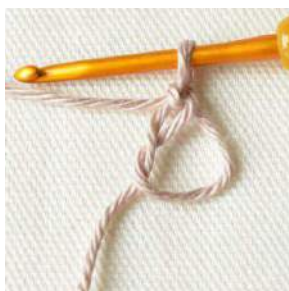
Pic. 8 Draw up a lp, ch1